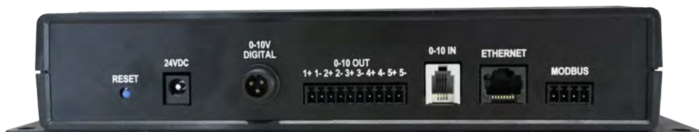
Back side view of the Echo Air with all available connections