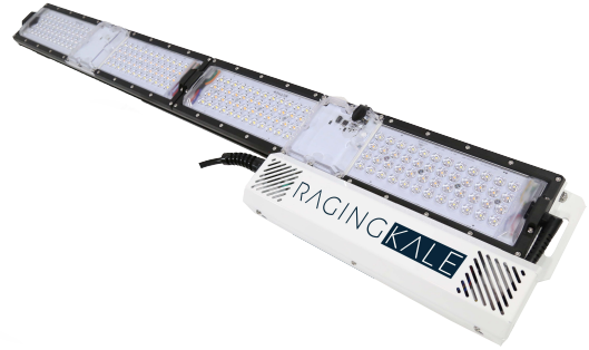
Picture Of Luminaire

Luminaire Manufacturer: Scynce LED Luminaire Model: Raging Kale Voltage: 209.9 volts Power: 247.95 watts Current: 1.192 amps Power Factor: 0.990 Frequency: 60Hz Ambient Temperature: 25 C Luminaire Temperature: 53.8 C